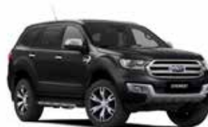
BLACK MICA METALLIC